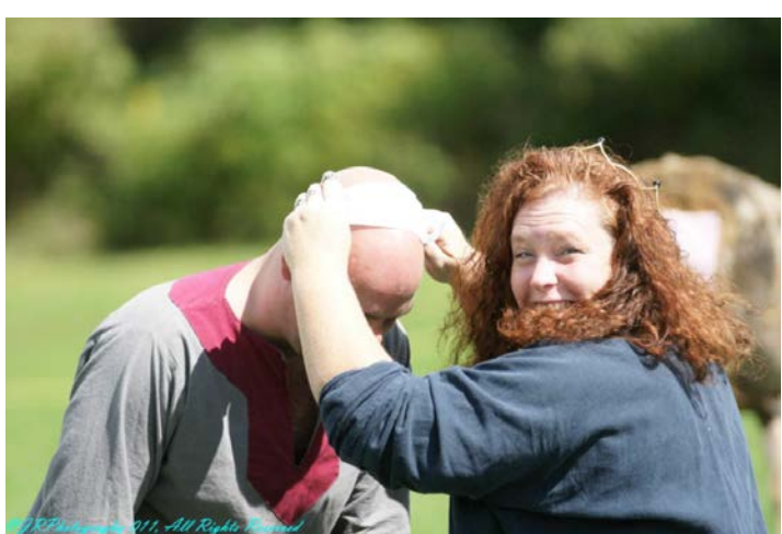
The Queen's handmaiden applies sun block and buffs the TW Champion on orders from the Queen.