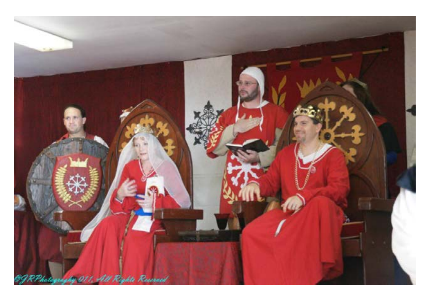
ROYAL COURT AT HARVEST RAID

NOVEMBER - DECEMBER A.S. XLVI - 2011 C.E.