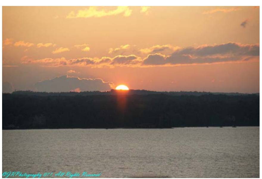
SUNSET AT HARVEST RAID