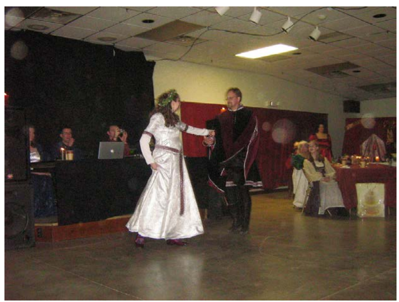
First Dance as Husband and Wife