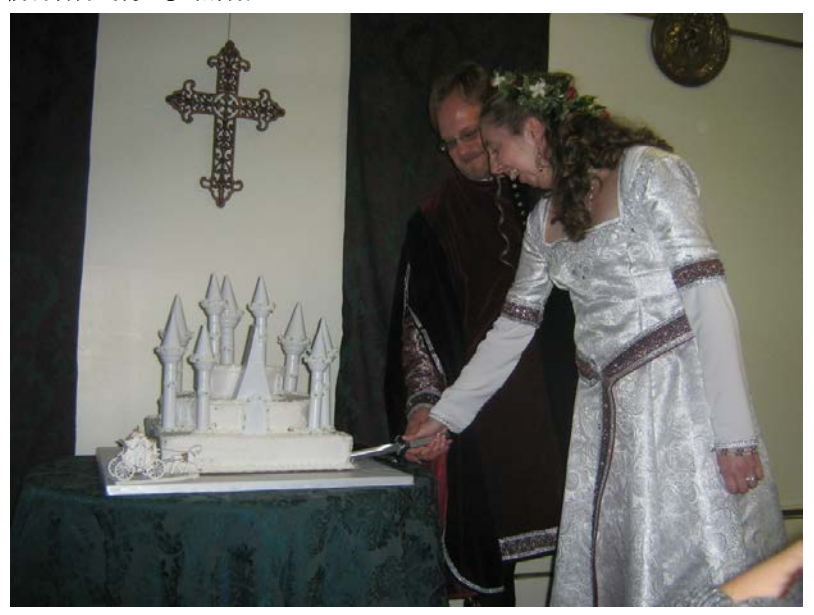
Cutting the Wedding Cake