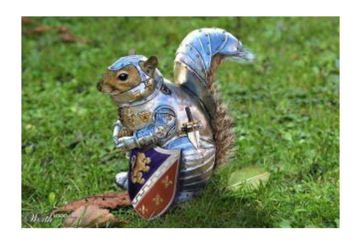
Count Sir Richard the Squirrel-Hearted