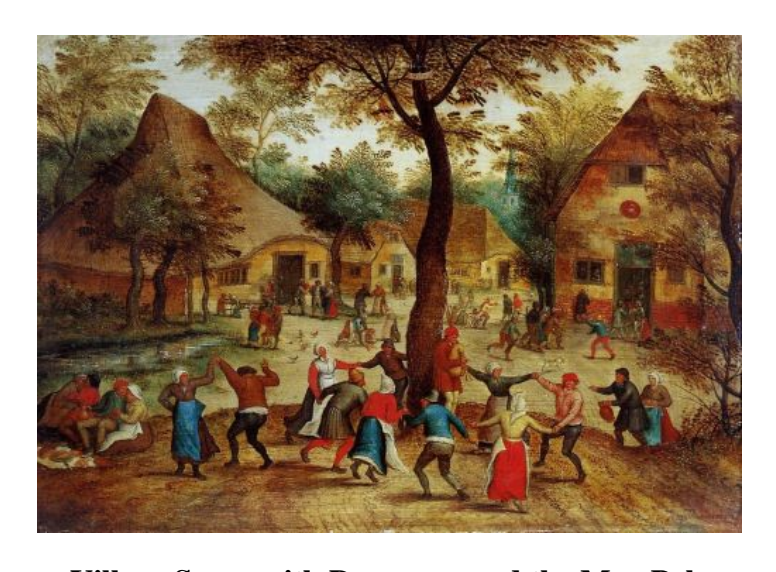
<u>Village Scene with Dance around the May Pole</u> Pieter Bruegel the Younger (1634) Tiroler Landesmuseum in Innsbruck, Switzerland.